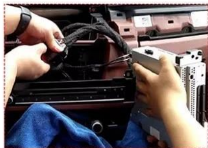
6. Power cable inserted into the original male-female heads