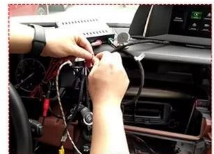
Connect rear camera With the back view LVDS cable