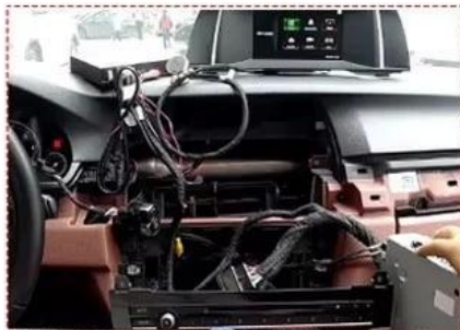
Start the car, enter CarPlay interface