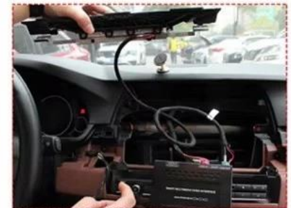
Lossless connection without tangent