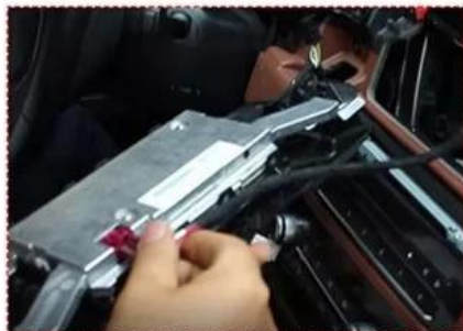
5. Plug LVDS cable with the car screen