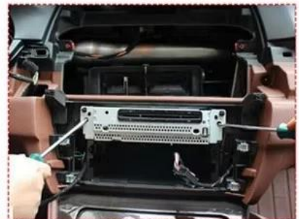
3. Disassembled car head unit