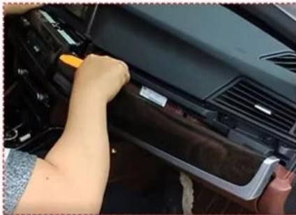
1. Disassembled car decorative panel