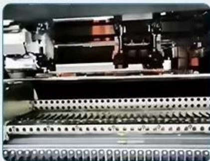
Electric batch leakage test