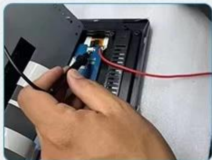
Electric batch leakage test