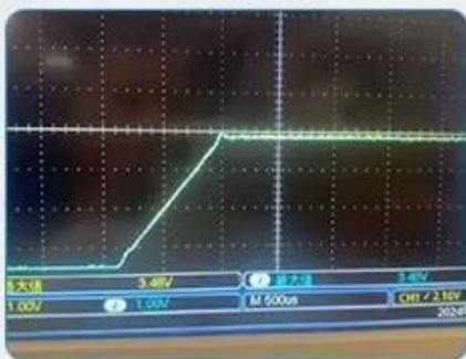
Touch clock and data voltage monitoring