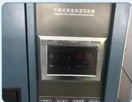
Low temperature test 2