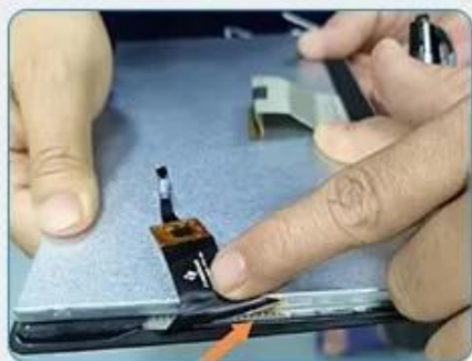
Touch screen cable breakage