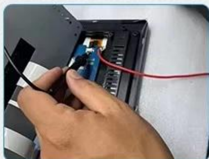
Electric batch leakage test