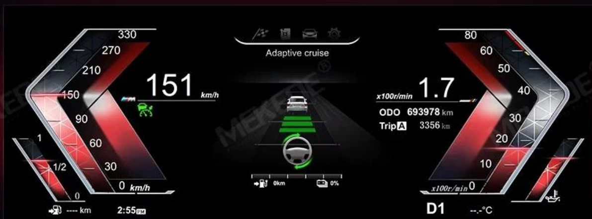
■ Technology mode