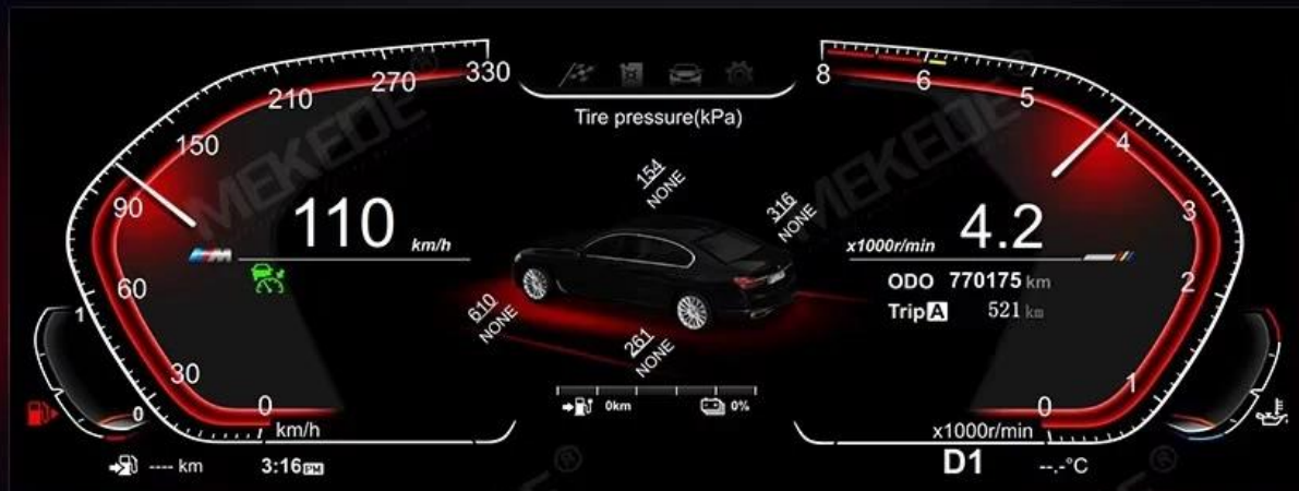
■ Simple mode

You can choose the theme mode you like, each theme has a variety of colors to choose from