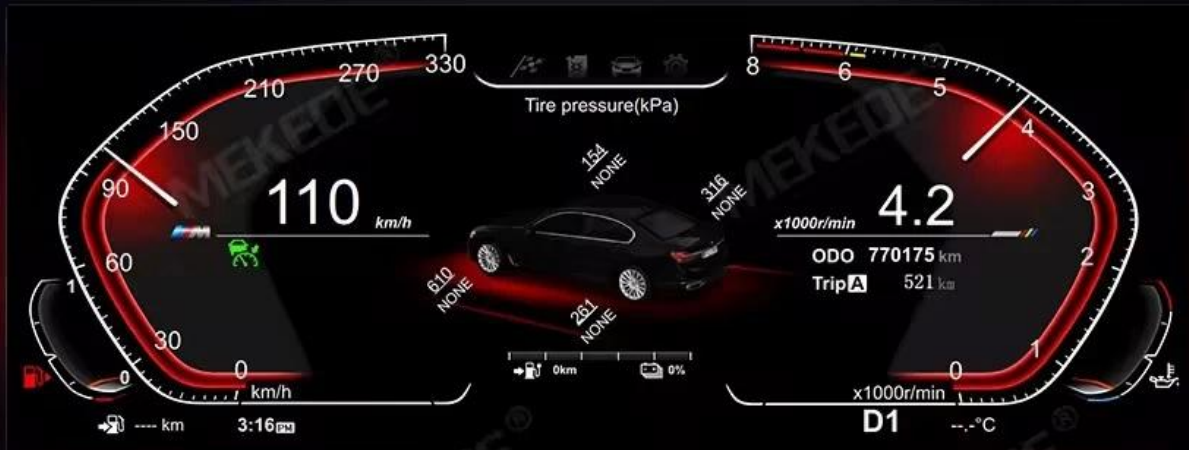
■ Simple mode

You can choose the theme mode you like, each theme has a variety of colors to choose from