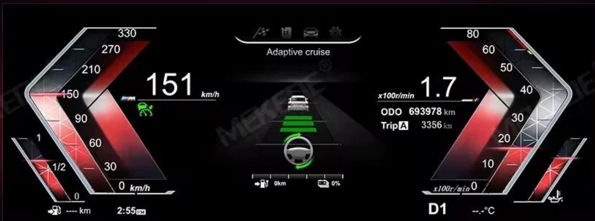
■ Technology mode