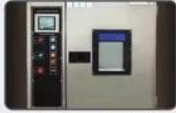
High-low Temperature Test