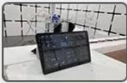
Radio Model Test