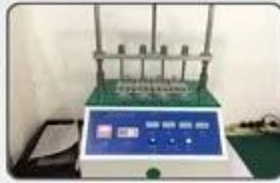
Key Life Test