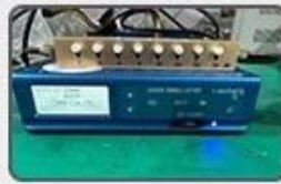
GPS Signal Test