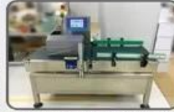
Automatic Weighing Test