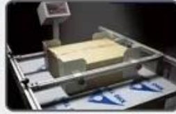
Simulating Transportation Test