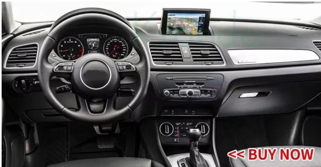
Original telescopic screen with navigation It was only suitable for fixed 8.8 inch screen

order bid to avoid mistake, if you are not sure this unit fit for your car or not, please send your real car dashboard picture to us, we will confirm it for you!