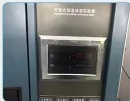
Low temperature test 2