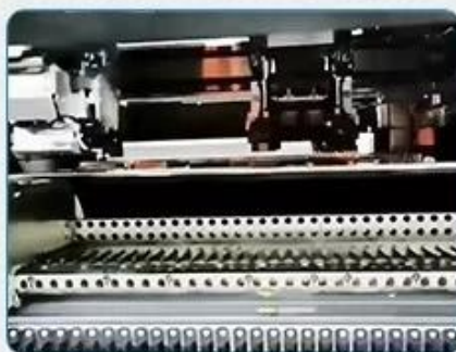
Electric batch leakage test