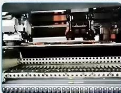
Electric batch leakage test